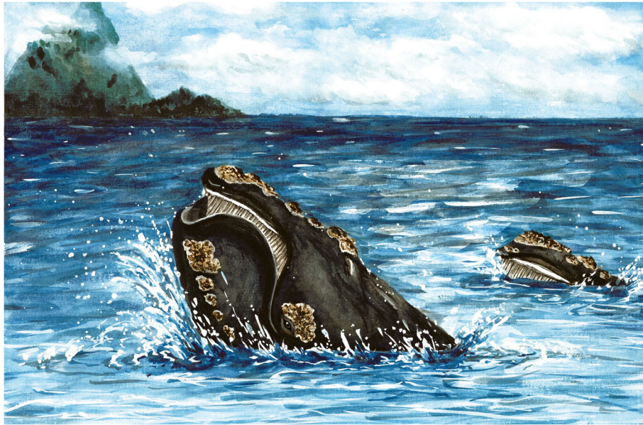
Fig. 3 Artistic reconstruction of tropical Eubalaena in the Pleistocene of Taiwan (©Lab of Evolution and Diversity of Fossil Vertebrates, National Taiwan University; illustrated by Chang-Han Sun)